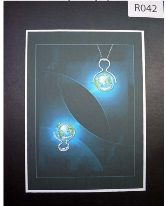
Name: Tang Yuk Ying Title: The Unique Earth