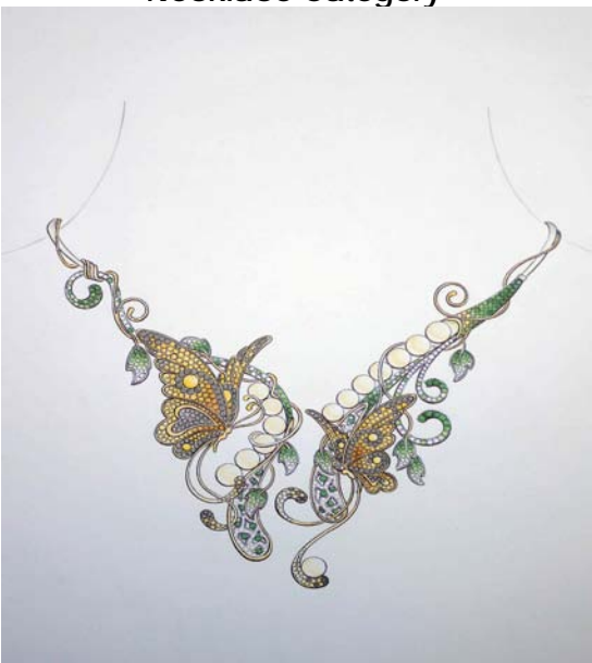
Name: Gan Soek Lan Title: Crstaylization of Love